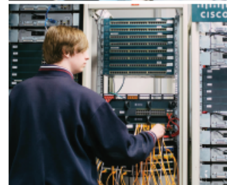
Top to bottom: Sport and Recreation, Animal Studies, Cisco®