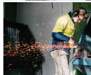
Top to bottom: Laboratory Skills, Integrated Technologies, Engineering